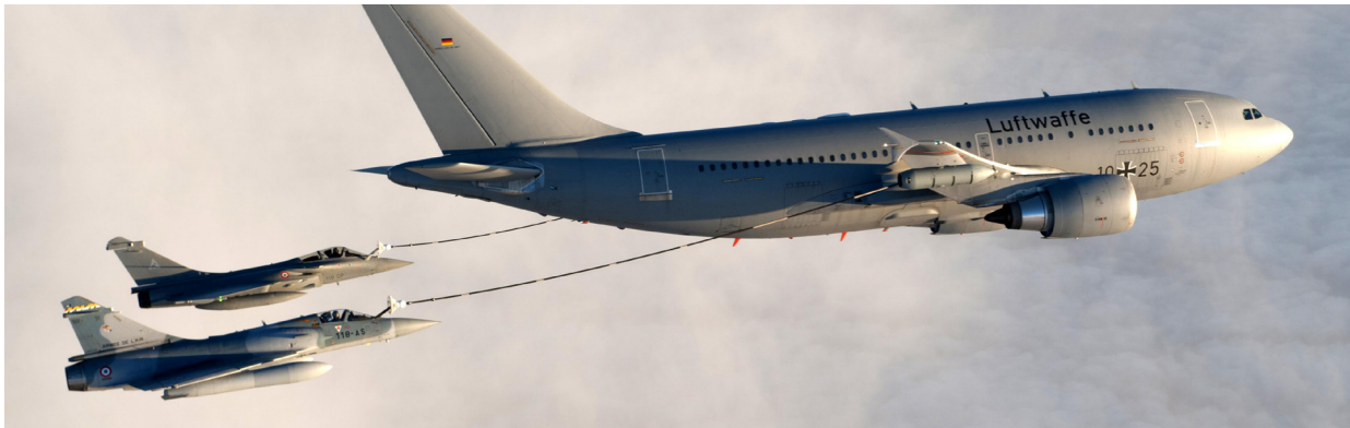
EART 2014