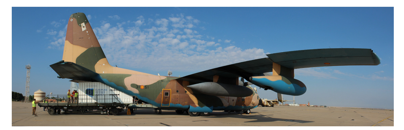
Last update: 7 September 2017