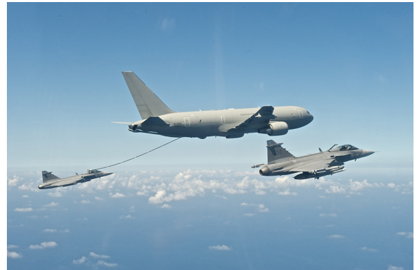
AAR collective clearance campaign, Italy, September 2013.

Solutions to increase the amount of European tankers are expected to only take effect by the end of this decade. Pressing as the AAR shortfall is, the Agency evaluated and proposed short-term solutions to Member States: