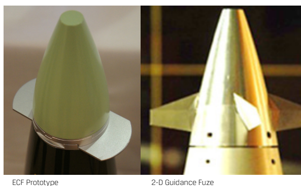
ECF Prototype

The European Defence Agency (EDA) has commissioned the Swedish Defence Research Agency (FOI) and the Netherlands Organisation for Applied Scientific Research (TNO) to study the integration of Course Correction Fuzes into artillery systems in EDA pMS. The aim is to support the identification of potential synergies in the field of precision engagement and to allow the promotion of further cooperative initiatives at European level.