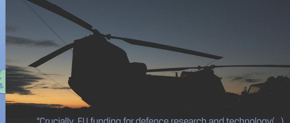
"Crucially, EU funding for defence research and technology(...) will prove instrumental in developing the defence capabilities Europe needs"

and autonomous access to space and permanent earth observation, the document emphasizes.