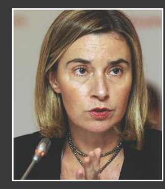
8. Serving European Security – Towards defence cooperation becoming 'the norm' An analysis of the main defencerelated aspects of the EUGS