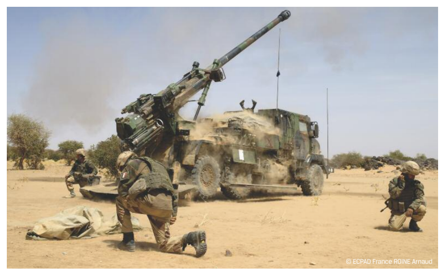
CAESAR artillery system in operation with French Armed Forces in Mali