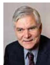
Director General Svein Efestad Department of Security Policy