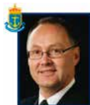
Rear Admiral Bernt Grimstvedt Inspector General Royal Norwegian Navy