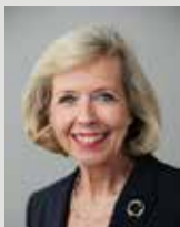
Defence Minister Anne-Grete Strøm-Erichsen