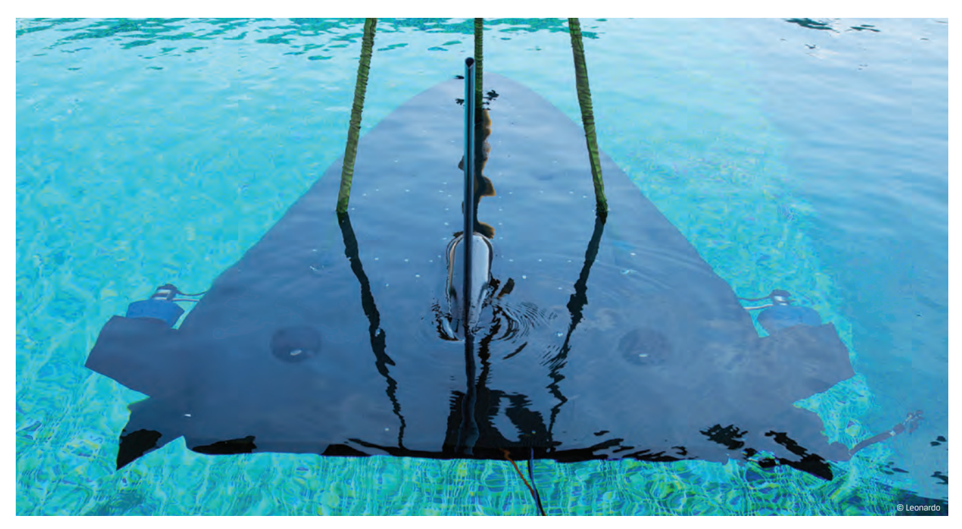
Leonardo V-Fides wire-guidable vehicle for underwater identification & detection used both as ROV (Remote Operated Vehicle) and AUV (Autonomous Underwater Vehicle)

would thus appear to be the most receptive to autonomous unmanned vehicles.