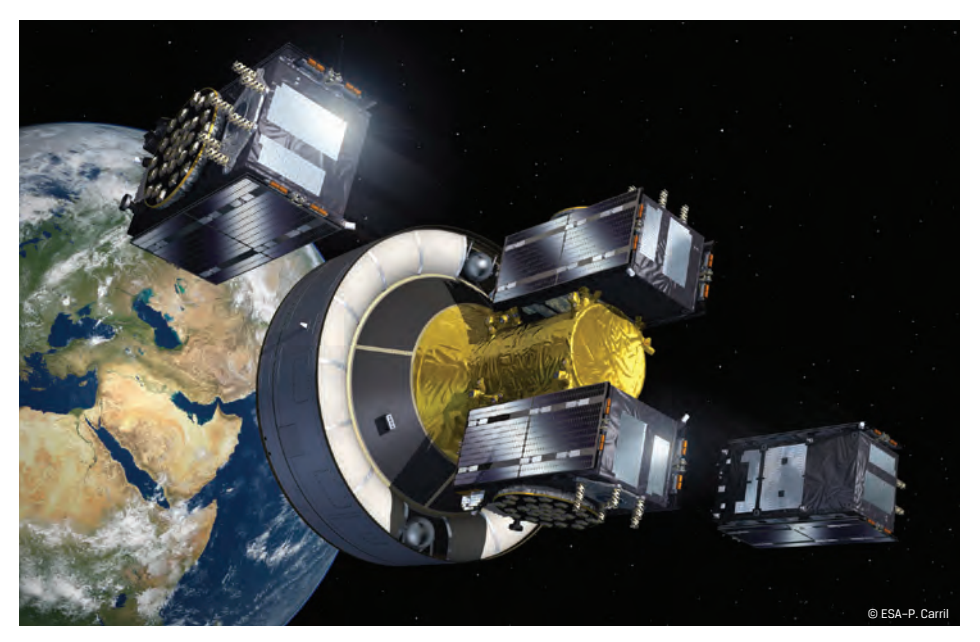
Although Galileo/EGNOS is a civilian programme, it could also benefit the Armed Forces

In parallel with these EU initiatives, the European Defence Agency (EDA) has put