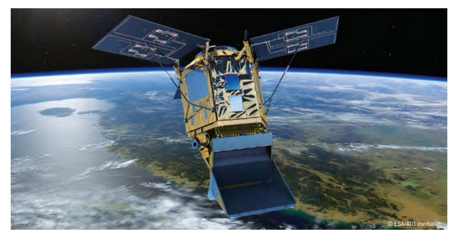
The Copernicus programme can deliver benefits to both civilian and military sectors