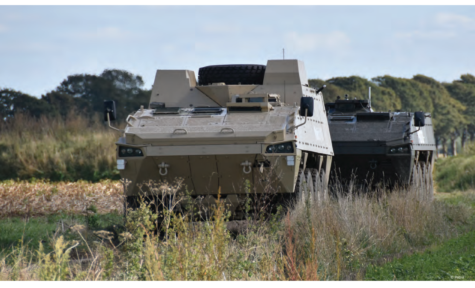
Patria AMV Vehicles during the Autonomous Vehicle Convoy Test at ELROB 2018 (Patria AMV 8x8 High Roof Version followed by autonomous Patria AMV 8x8)

problems. According to EDA's SafeMUVe study, the main gaps identified with respect to specific standards/best practices are concentrated in the modules related to the higher layer of autonomy, namely 'Automation' and 'Data fusion' aspects. Modules such as 'Environment perception', 'Localization & mapping', 'Supervision' (Decision-making), 'Motion planning', etc. are still in mid technology readiness levels (TRLs), and although several solutions and algorithms exist to perform the different tasks, no standards are yet available. In this sense, there is also a gap in terms of verification and certification of these modules, partly addressed by the EU funded European Initiative to Enable Validation for Highly Automated Safe and Secure Systems (ENABLE-S3) project. The recent establishment, by the EDA Steering Board, of a Land Test Centres Network of Excellence (LTE) is a first step in the right direction. The LTE allows national test centres to undertake joint initiatives in view of preparing the testing of future technologies, such as automotive systems and robotics.